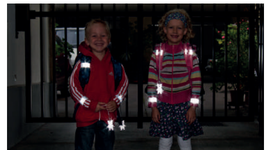
Safety through visibility!

Make sure your child is seen in time when negotiating road traffic. Especially in autumn and winter, when it is still dark in the morning or in foggy weather, bright clothing is advantageous. An even better effect can be achieved with reflectors on clothing and school bags. Thus equipped, children can be seen by car drivers from a distance of 130 metres.