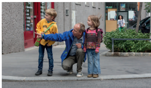
Regularly practising together is important!

Walk the school route with your child and explain to it what makes certain points dangerous and what it needs to pay attention to as a pedestrian. Practise problem points (see school route map) particularly well. Next time, let your child guide you and have it talk about its behaviour while it does so. Thus, you can test whether it has understood everything correctly and take corrective action, if necessary.